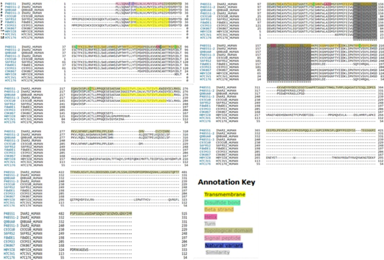
Figure-1: Alignment; Human IFNAR-2 protein