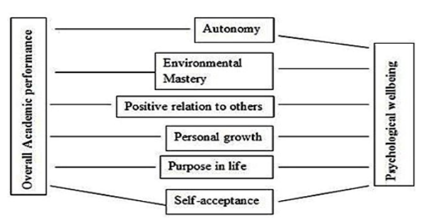
Figure-1: Conceptual framework of study

Learners' psychological wellbeing (PWB) has multiple links with the academic performance. Yet most of the studies on psychological wellbeing have not cited the correlations of six dimensions (of PWB) with overall educational performances. Such larger scales studies were needed in Pakistan region to assess this relation. This study fills the gap in the empirical understanding of the relationships between medical students' psychological wellbeing and overall academic performance. Figure-1 shows concept of study.